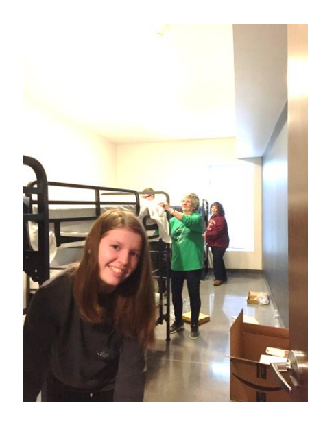
Above: Volunteers making beds in preparation for the men to move in.